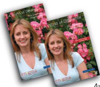
Available on VHS & DVD

Running Time: Approx. Part 1: 30 minutes, Part 2: 23 minutes, Part 3: 25 minutes