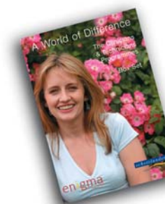
Available on DVD