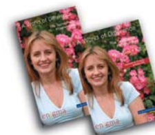
Available on VHS & DVD

Running Time: Approx. Part 1: 20 minutes, Part 2: 20 minutes