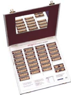
Enigma chairside assortment